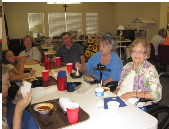
Fun times inside and out